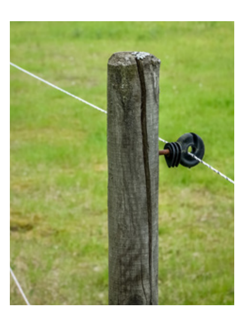
Electric fences are specially insulated from the ground and can pick up an induced charge from transmission lines