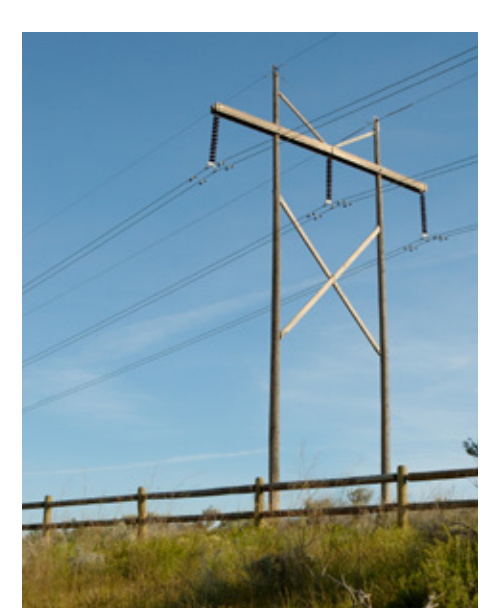
LOOK UP! Equipment that can be extended, such as a grain elevator or stack mower, requires the utmost care when within the easement right of way.

A. Fueling vehicles under transmission lines is not recommended. If you must fuel a vehicle under a transmission line, use a non-metallic or plastic container. The vehicle should also be grounded to eliminate any source of sparks.