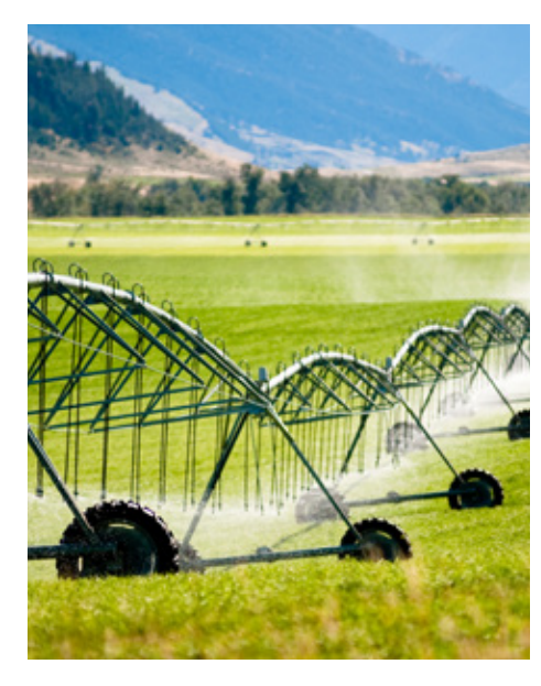
You should never allow a solid stream of water to hit a transmission line wire. Be sure to note the guidelines in this section.